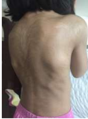
Figure 1. A flare-up with swelling of the back of a young girl diagnosed with FOP. The picture is shown with the consent of the patient and her parents.