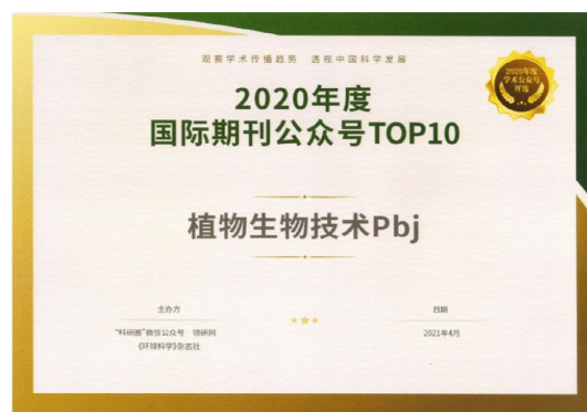
Figure 5 PBJ WeChat account was recognized among the Top 10 academic WeChat accounts of 2020 in China.