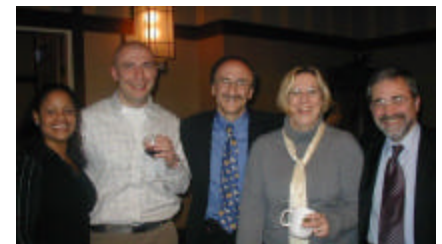
Holiday cheer shared by CCEBers of all ages.