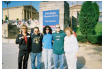
Above, the 2005 AIDS Walk Team prior to the 8.5-mile trek and, below, at the half-way point, with the remainder of the team, pausing at the Falls Bridge.