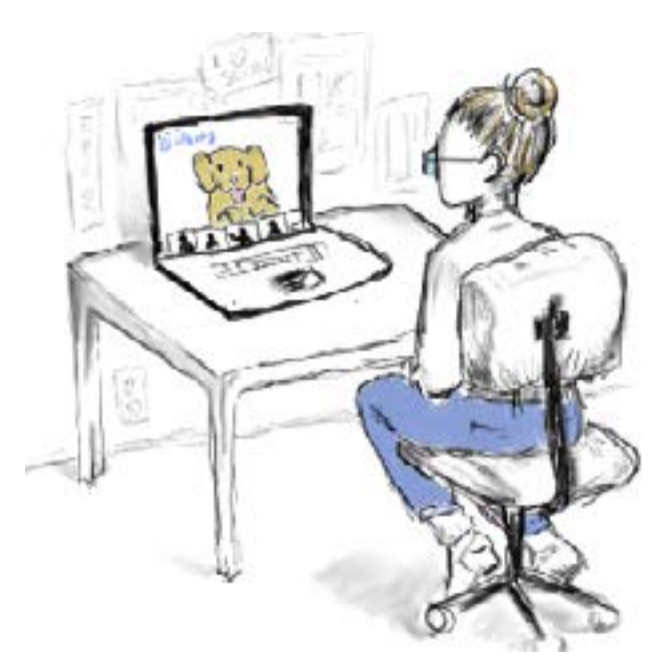
After months of remote learning, graduate programs have fi nally realized the best way to keep students engaged in class is to have puppies give the lectures.

break down class work, one student suggests: "To-do lists and short-term goals (think weekly) are extremely helpful to keep you on track and make sure you don't fall behind."